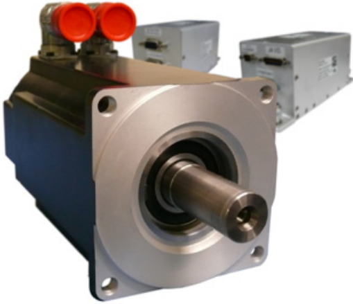
Figure 2 - SensINTNet Product

A single Controller Module (CM) supports one or multiple motor Drive Modules (DMs).